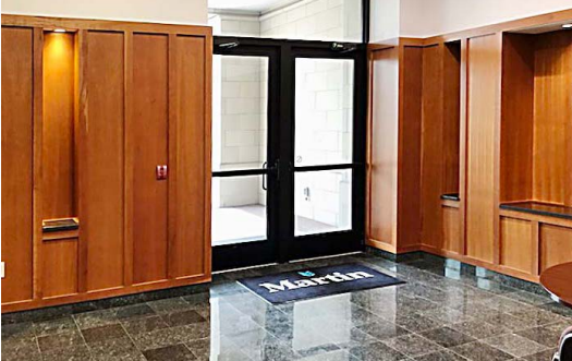
First Floor Lobby